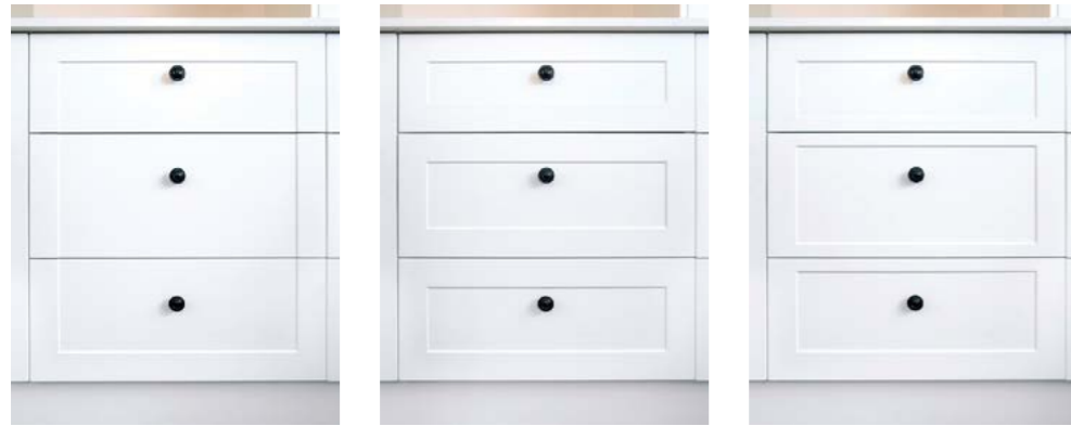
A Drawer Bank